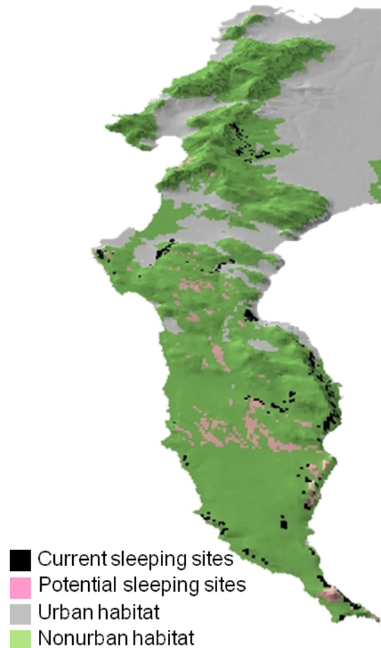
Fig. 3. A three-dimensional habitat map showing the distribution of grid cells currently used as sleeping sites (black) and grid cells not used as sleeping sites (pink) that are ≥500 m from the urban edge and which match the characteristics of used cliff sleeping sites.

Baboon sleeping sites (black cells (Fig. 3)), were located in close proximity to both urban areas—where preferential food sources occur—and along the coastline, where suitably steep and high sleeping-site cliffs occur. Troops slept in trees, on cliffs, and on the rooftops of buildings (Table 2). Four out of the six troops that had access to all forms of sleeping sites slept in trees more often than on cliffs. The mean elevation of cliff sleeping sites used was 167.07 m (±53.47 m SEM) and the mean slope was 21.91° (±5.86° SEM). The Cape Peninsula also included an area of 11.6 km 2 (504 grid cells) of suitable but unused sleeping-site area (pink cells (Fig. 3)). These grid cells were all situated ≥500 m from the urban edge, comprised natural habitat, and matched the elevation and slope characteristics of cliff sleeping sites used currently.