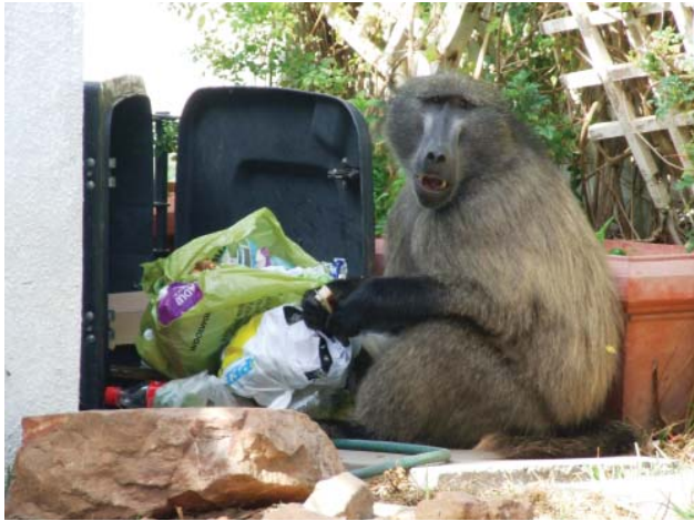
Figure 2. Baboon raiding a dustbin in the residential suburbs of Cape Town, South Africa.

baboon population to inform decisions relating to baboon management, welfare and conservation, and the health risk to local humans and baboons. Ethical approval was gained from the Royal Veterinary College Ethics and Welfare Committee.